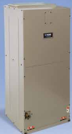
LX SERIES AHE MODEL SINGLE-PIECE DESIGN

Everyone wants time to relax and be comfortable. That's why we created LX Air Handlers, so you get a perfect match with your air conditioner or heat pump. And you'll like the confident feeling that comes with dependable performance, energy efficiency and operating economy. We give you the best design so you don't have to sweat the details. And because it's built by York—the industry leader in innovative design—you know your system won't be down when you want some down time.